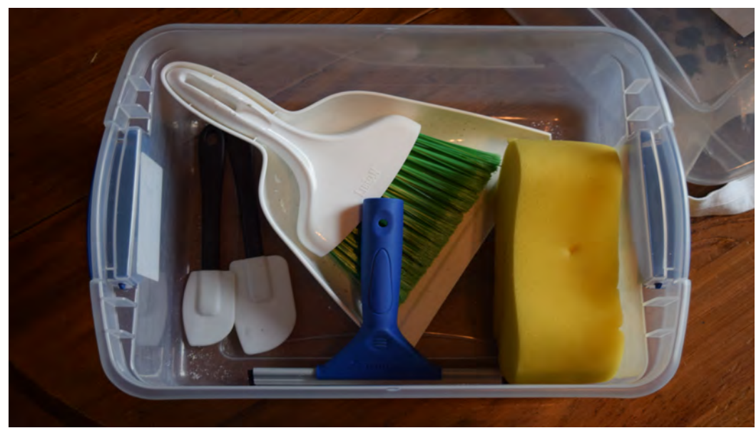
ALL PARTS MUST BE DRY BEFORE STORING