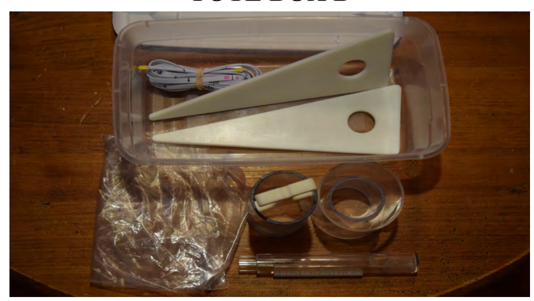
ALL PARTS MUST BE DRY BEFORE STORING