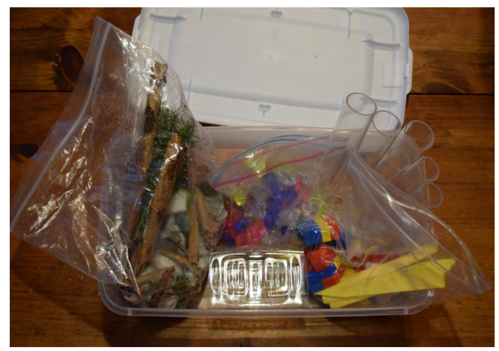
ALL PARTS MUST BE DRY BEFORE STORING